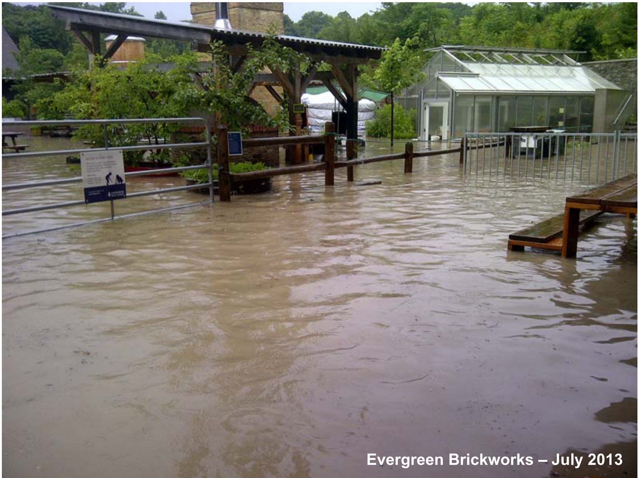
Evergreen Brickworks – July 2013