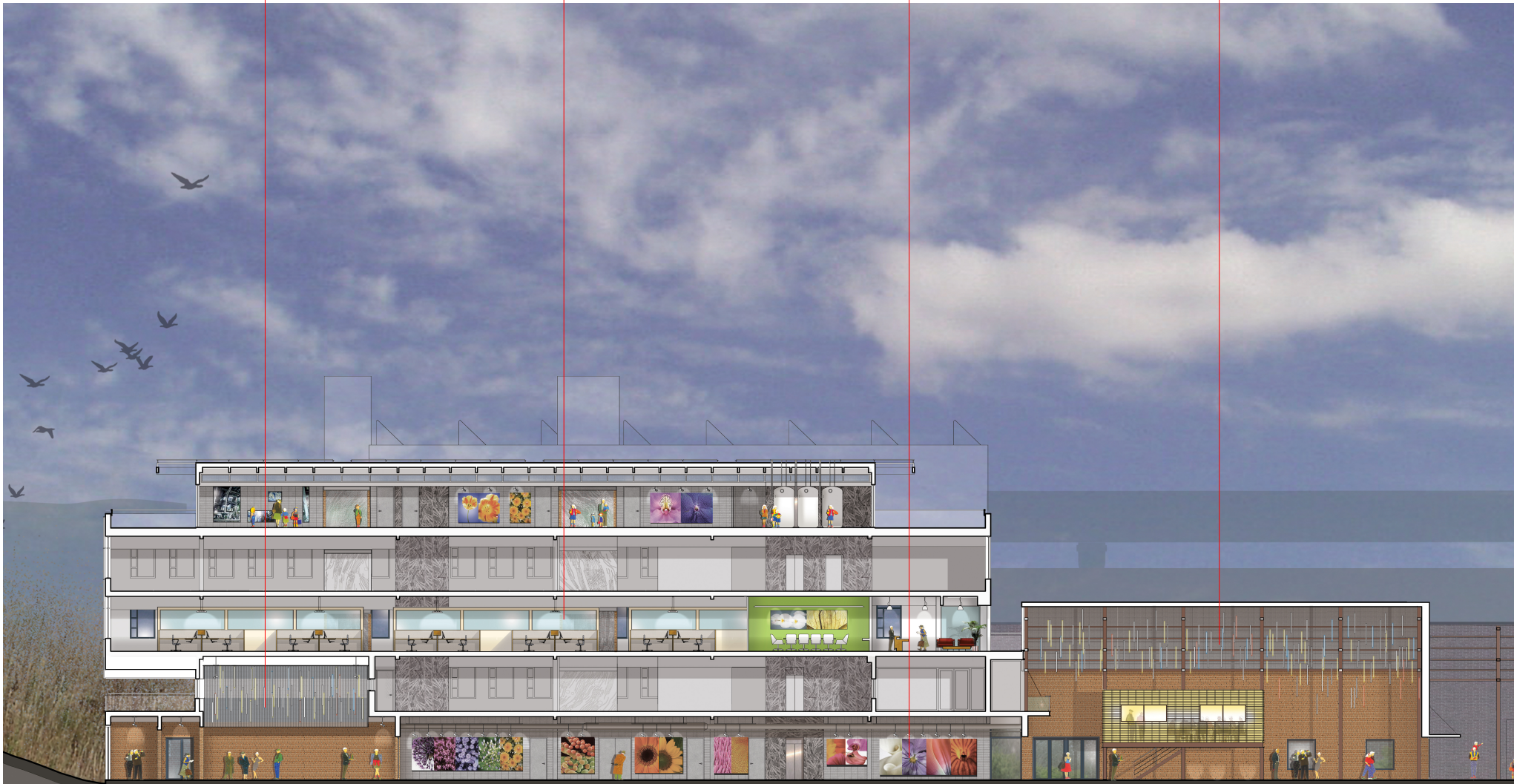
Center for Green Cities, Evergreen Brickworks – North-South Section

Welcome Centre: 4,900 sq ft for reception, events, exhibitions